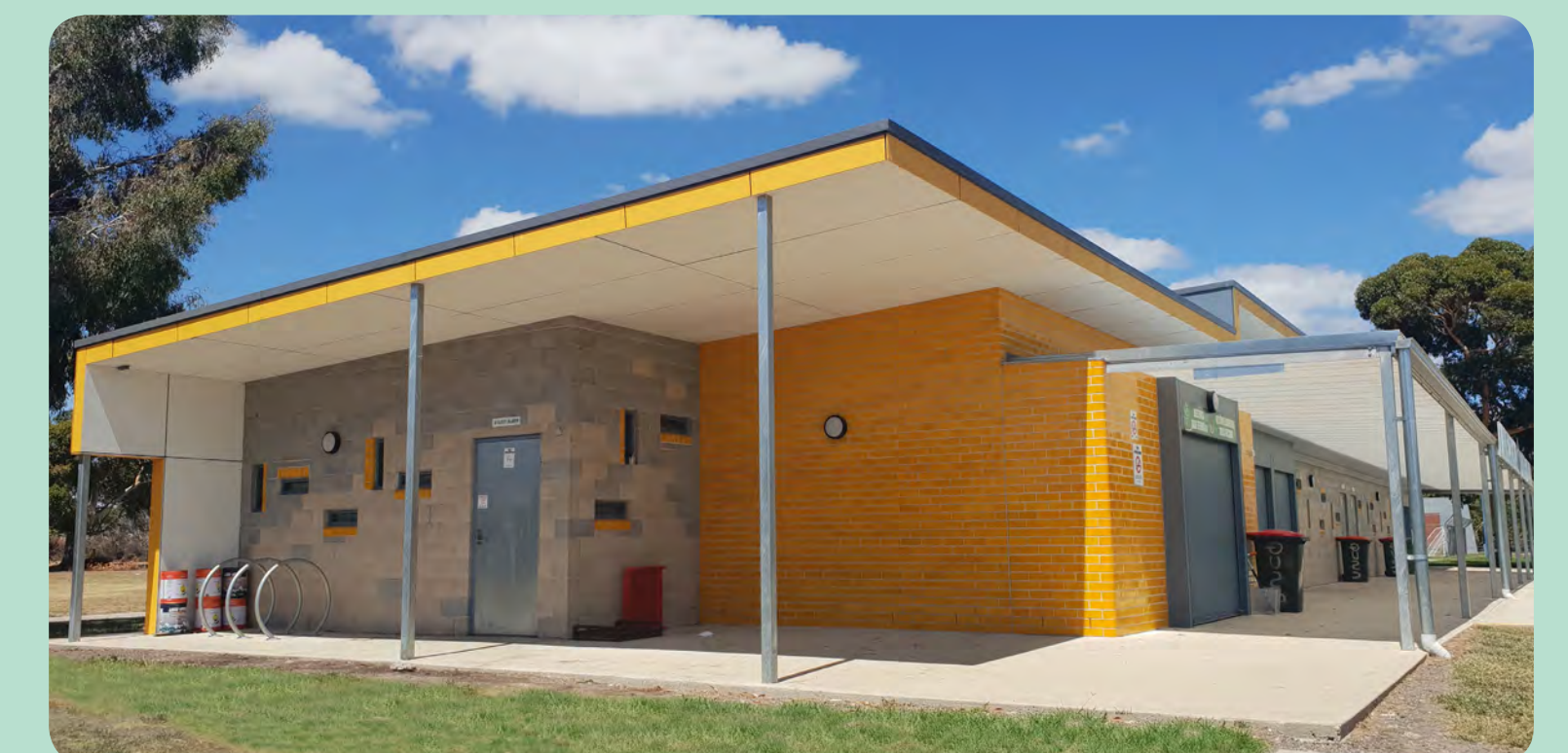
Sports pavilion (Barrymore Road Reserve)