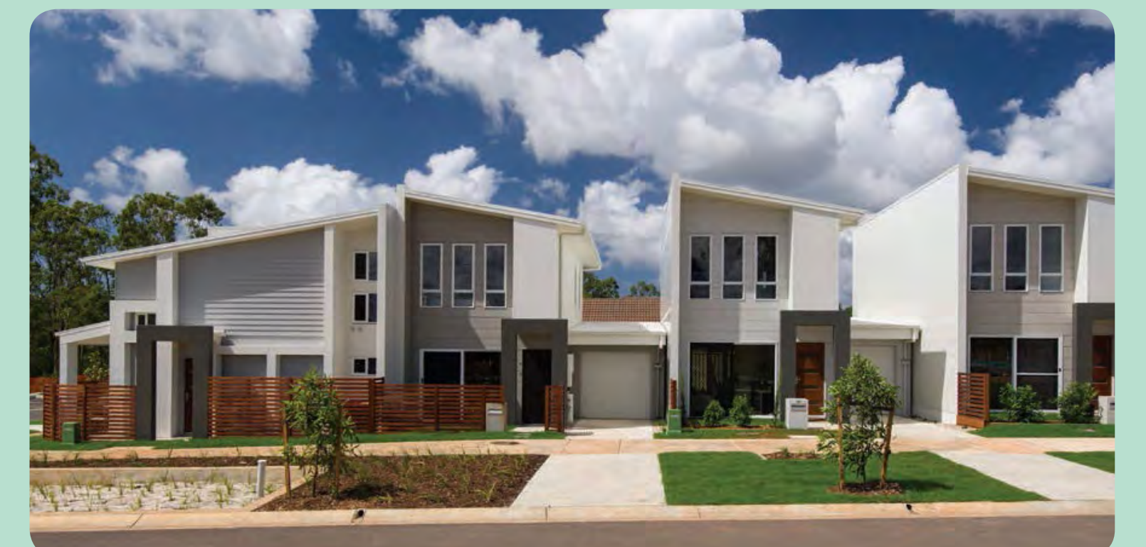
Housing (Fitzgibbon Chase)