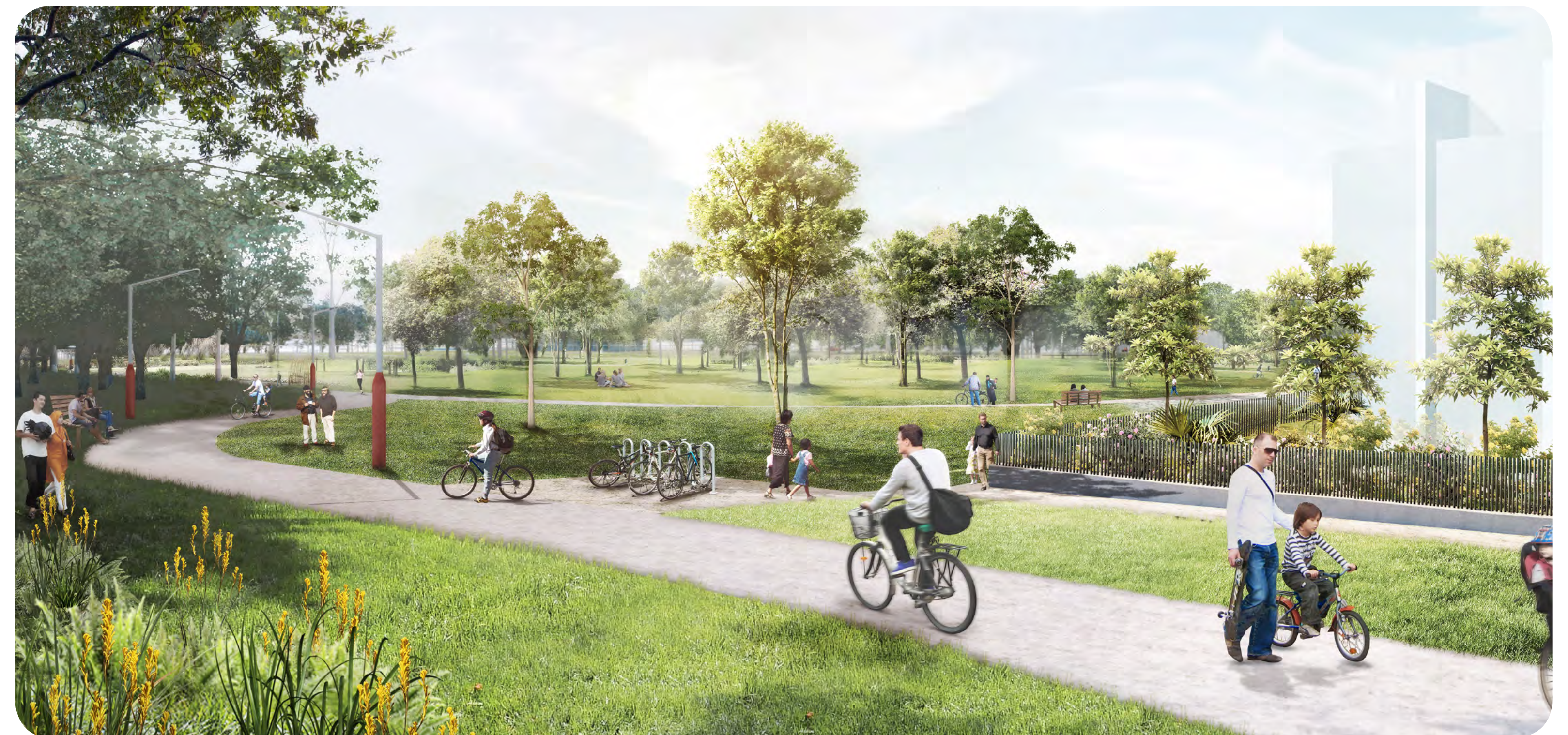
Artists impression of the Meadowlink connection into Seabrook Reserve

Hume City Council is proposing the above masterplan, as part of improvements to Seabrook Reserve.