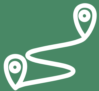
Improved path connections