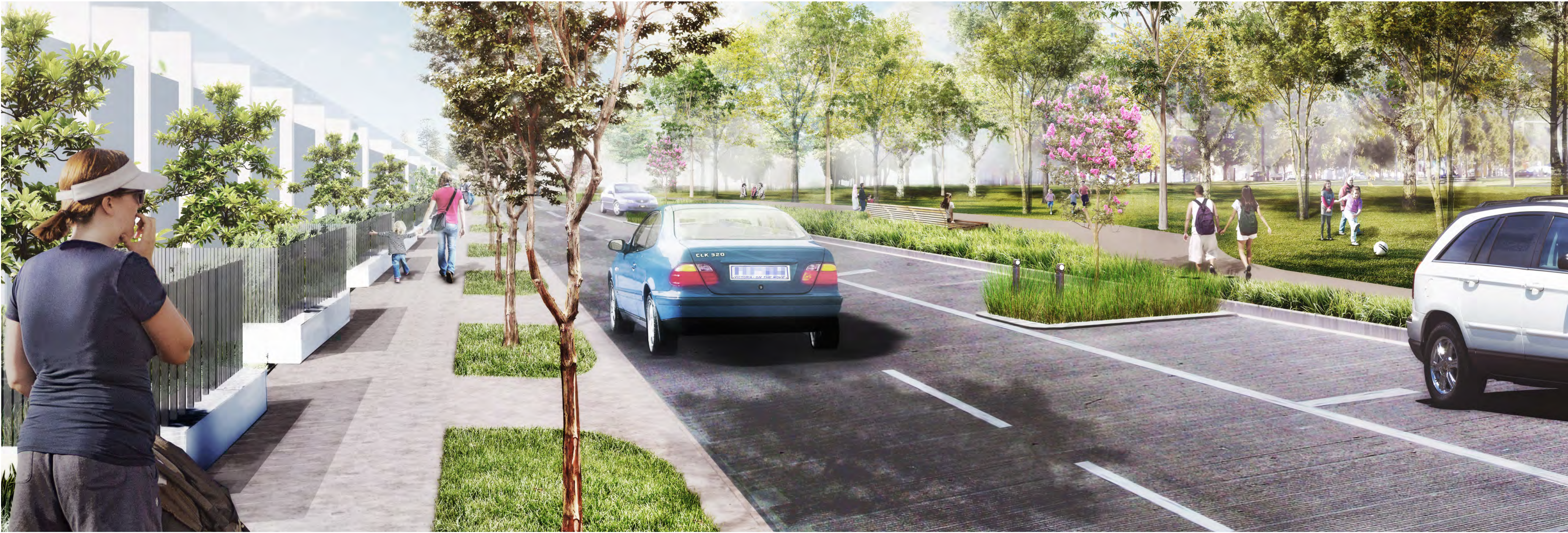
Artists impression of Seabrook Reserve local road