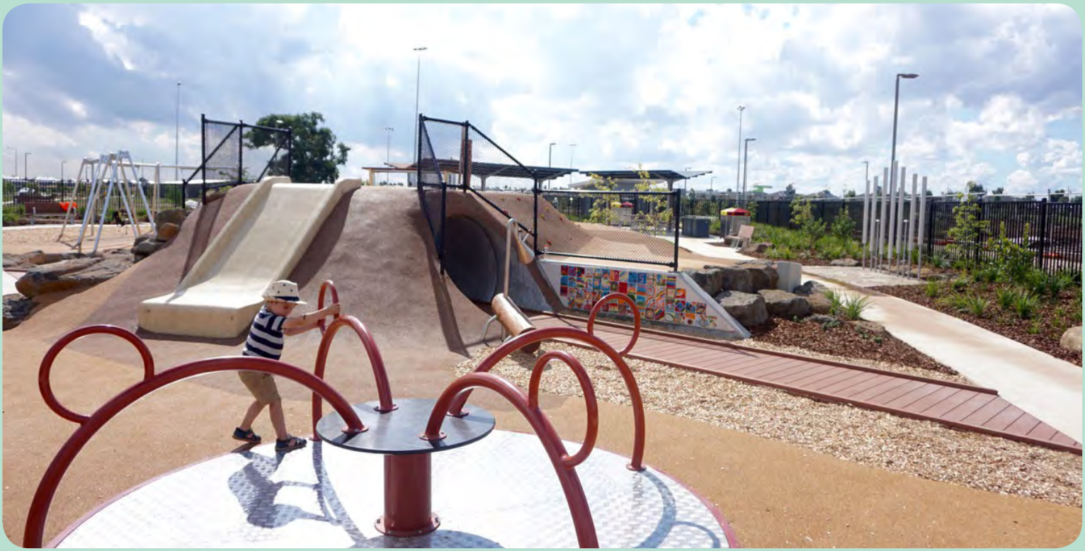
Play Space (Craigieburn)