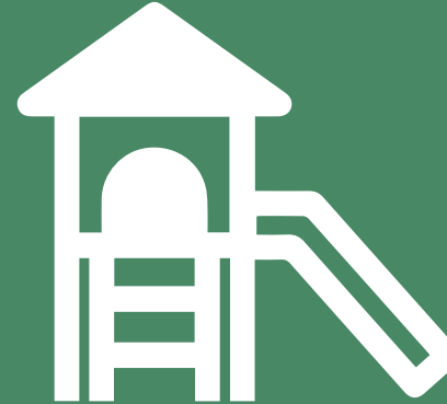
District quality play space