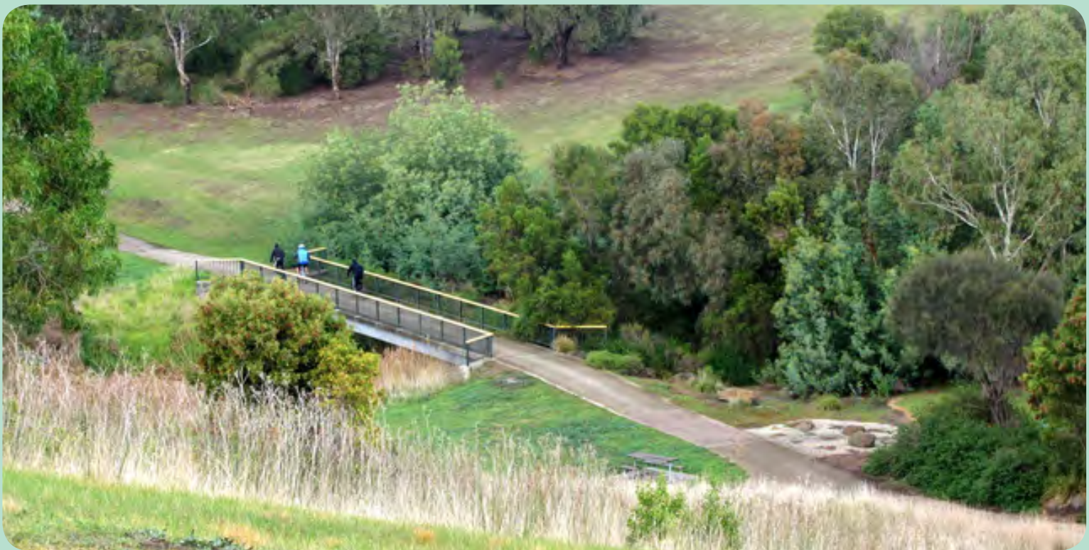
Pedestrian bridge (Broadmeadows Valley Park)