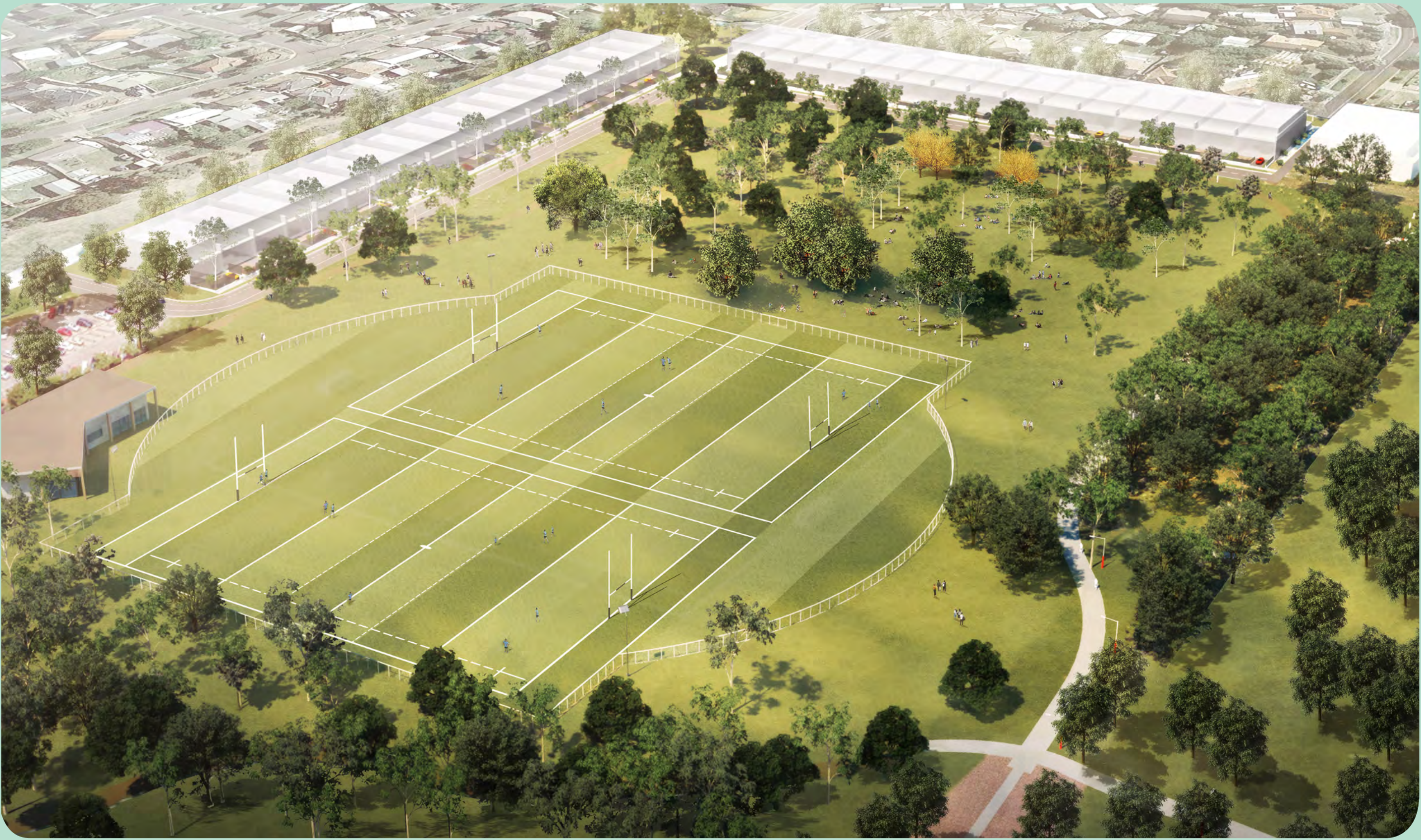
Artists impression of Seabrook Reserve sports facilities