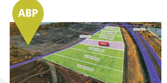
Amaroo Business Park