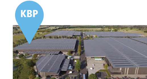
Kinetic Business Park