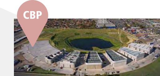
Cade Business Park