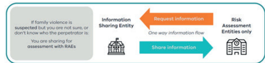
Figure 1: Overview of activities when sharing information for risk assessment

Family violence risk assessment is an ongoing process and is required at different points in time from different service perspectives. Education and care services will have a role in working collaboratively with other services to contribute to ongoing risk assessment and management of family violence.