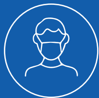
Fitted face masks