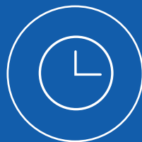
Staggered entry and exit