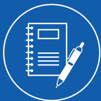
COVID-19 terms and conditions

These conditions apply to anyone entering a Hume City Council venue, including all visitors, customers, staff and contractors. Hume City Council has the right to refuse entry to anyone that does not follow the required health and safety measures.