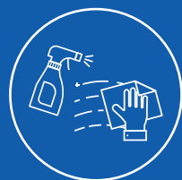
Cleaning and disinfection