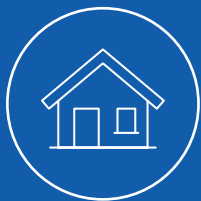
Your personal health