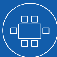
Layout and capacities