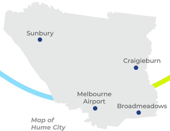
Map of Hume City

Calwell, Hawke, Maribyrnong, McEwen, Scullin