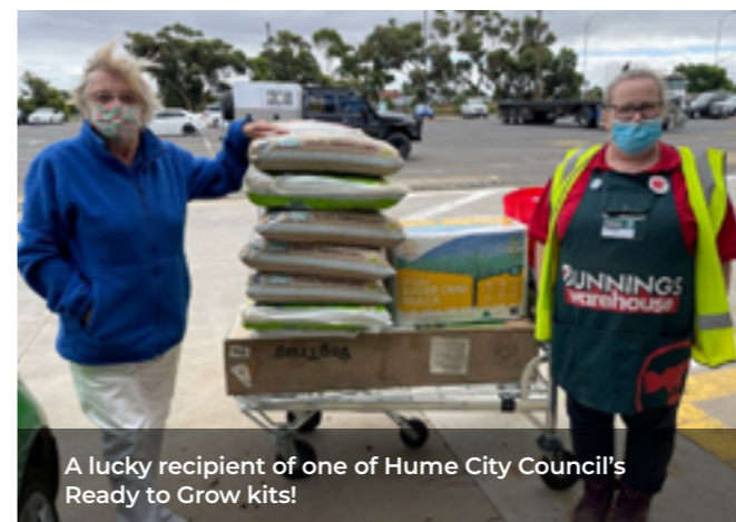
A lucky recipient of one of Hume City Council's Ready to Grow kits!

The best way to keep up to date with upcoming sustainability events is to sign up to our monthly Live Green eNewsletter at hume.vic.gov.au/livegreennews