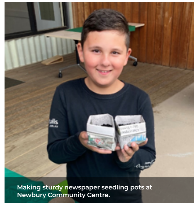
Making sturdy newspaper seedling pots at Newbury Community Centre.