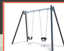
13. Double swing