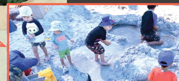
10. Sand and water play