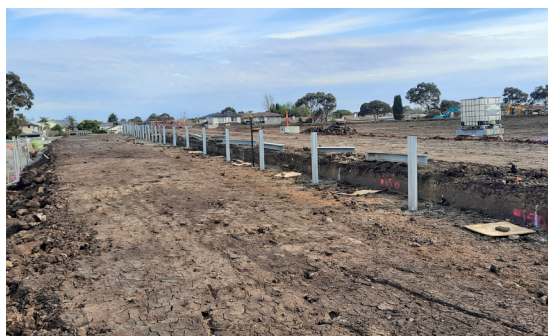
Preparing the area for retaining walls around the field.