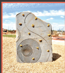
1. Climbing rope and boulders