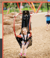
4. Flying fox