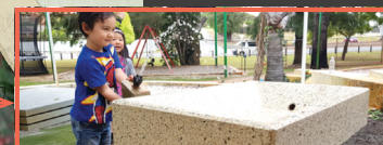
11. Accessible water play tray