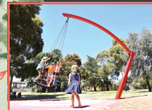
12. Basket swing