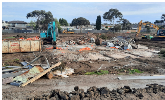
Goodbye to the old pavilion.

This project is delivered in partnership between Hume City Council, Victorian Government, NRL, Melbourne Storm, NRL Victoria and Touch Football.