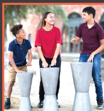
5. Outdoor percussion instruments