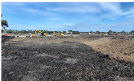
Levelling out the surface to prepare for construction.