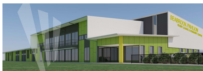
Architectural images of the new State Rugby League and Community Centre. Images courtesy of MKM Constructions