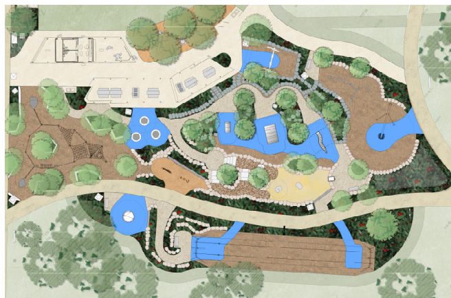
Landscape and playspace design

Creek re-vegetation, local habitat enhancement and water sensitive urban design will be undertaken to improve run off and water quality in the creek.